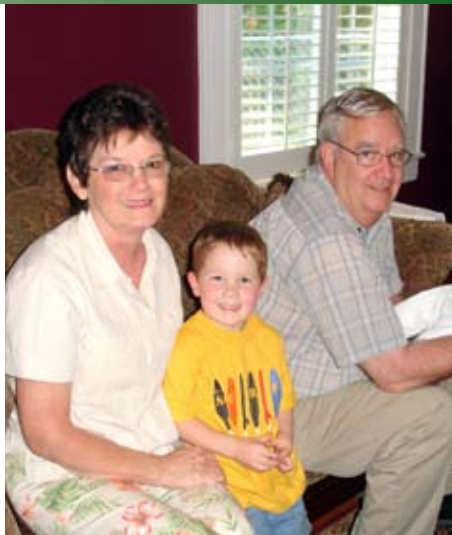
Dave's wife Sue went home to be with the Lord in September 2008