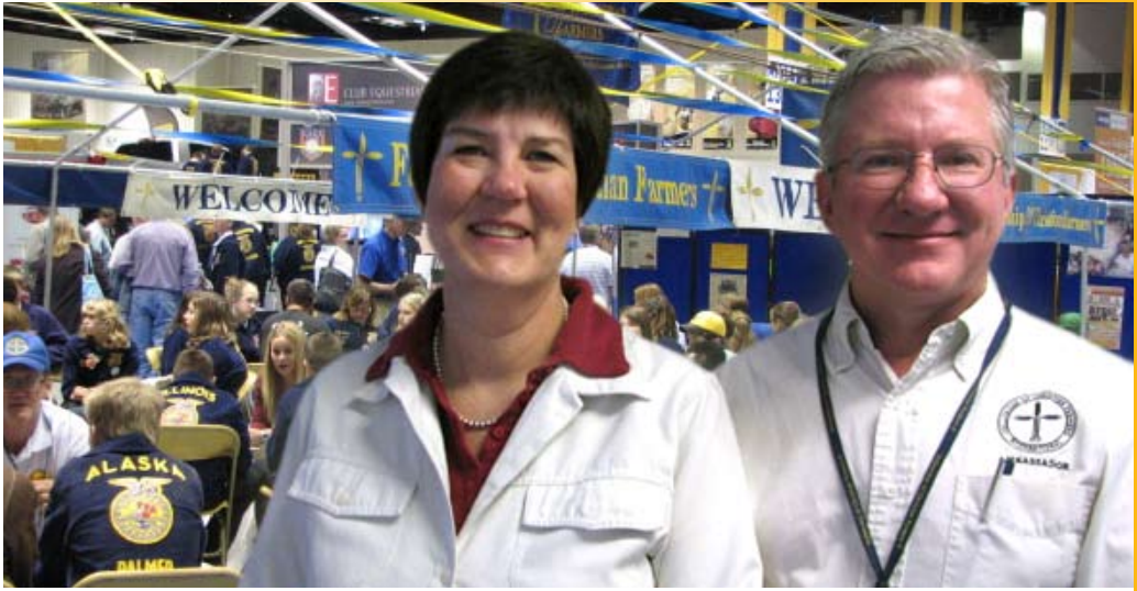
Sharing the Gospel at a Farm Show with the Wordless Walking Sticks