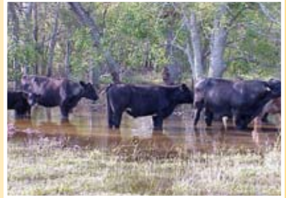
Flooding from Hurricane Gustav, 2008