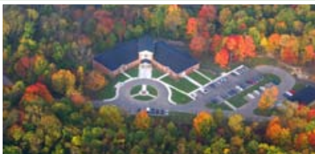
Life Action Headquarters